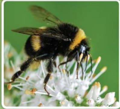
Fact Sheet: About B